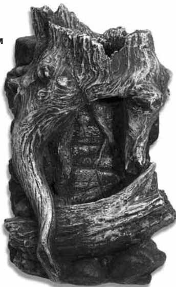
Repti Rapids™ LED Waterfall (RR-22 pictured)